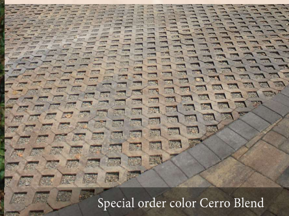
Special order color Cerro Blend

Turf pavers are manufactured with 5,000 psi concrete and comply with ASTM C1319, Standard Specifications for Concrete Pavements. Ideally grass would be seeded in the voids to create a green way that would have the structural performance of concrete. Turf pavers are intended to support the occasional vehicle that would travel upon them. Applications for Turfpacers would be emergency access roads, overflow parking areas and auxiliary driveways. Turfpavers are not intended for daily vehicle use and will most likely crack. This is normal and does not affect their performance. Turf pavers are only stocked in Grey, but can be ordered in custom colors. Set up charges may apply. For proper installation, see ICPI TechSpec 8.